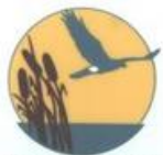
NEW JERSEY AUDUBON SOCIETY