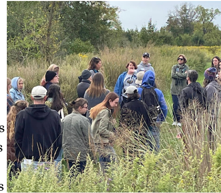
Go birding at: